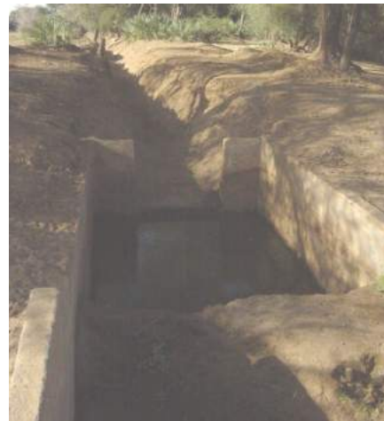
Canal crossing dug by the farmers