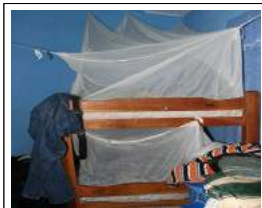
1 day's bed & food for peace trainee €10