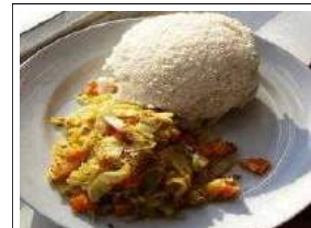
Food for Peace Trainer for week €20