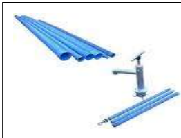
Pipes & Pump for school well €75