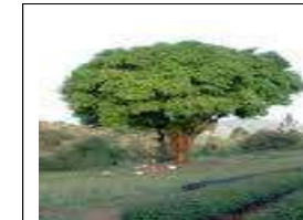
Plant 100 trees €100