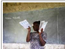
Teacher's Peace Manual €15