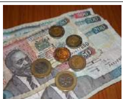
1 week's wages for Peace Trainer €60