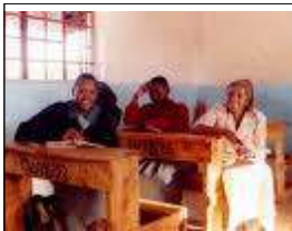
School desk €30