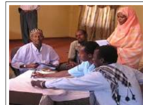
1 week's training in Con- flict Management €50