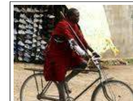
Bicycle for Peace Trainer €40