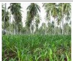
Drought resistant Seedlings €25