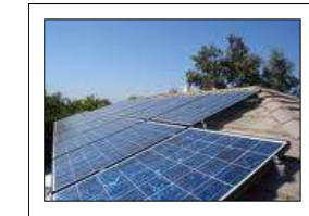
Solar panel for school €150