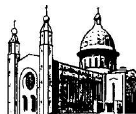
CHURCH OF THE HOLY SPIRIT DENNEHY'S CROSS, CORK