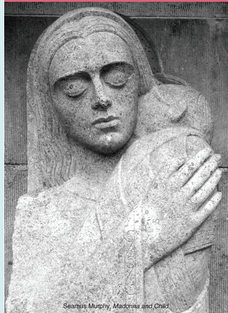
Seamus Murphy, Madonna and Child

Can we come together to build a Maternity Unit in our sister parish, Turkwel?